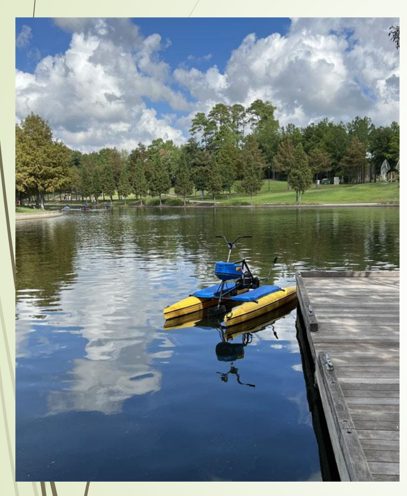
Woodlands Waterway Boathouse (February's paint-out location)

A paint-out is when a group of artists meet-up in a location to paint and draw together. When they meet at a scenic, inspiring outdoor location it's called a "plein air paint-out". It's a great way to share your talents, learn from others and enjoy the company!