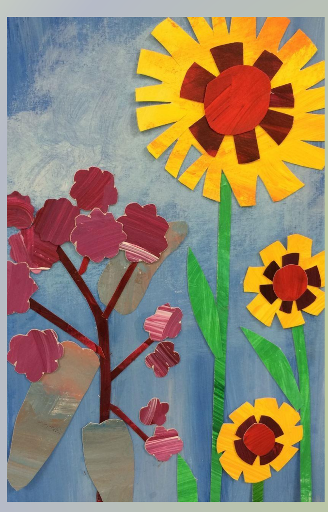
Youth Summer Classes