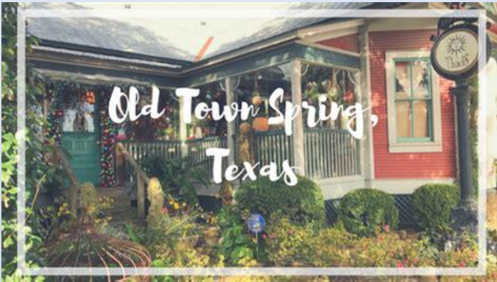
Old Town Spring

This is the last location where Paint Out Group met in December 2023.