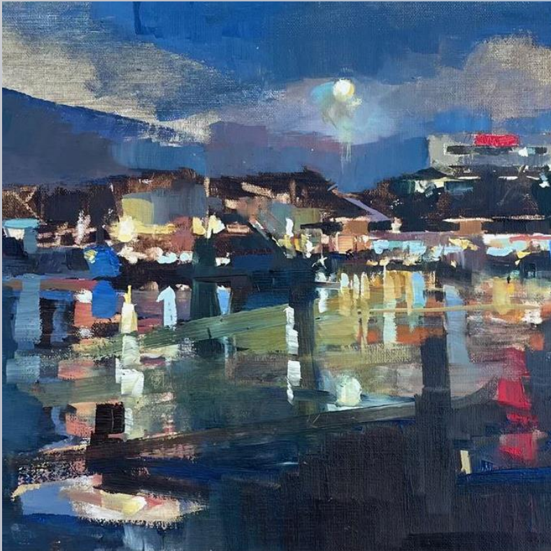
Nocturne Plein Air Workshop with Krystal W. Brown